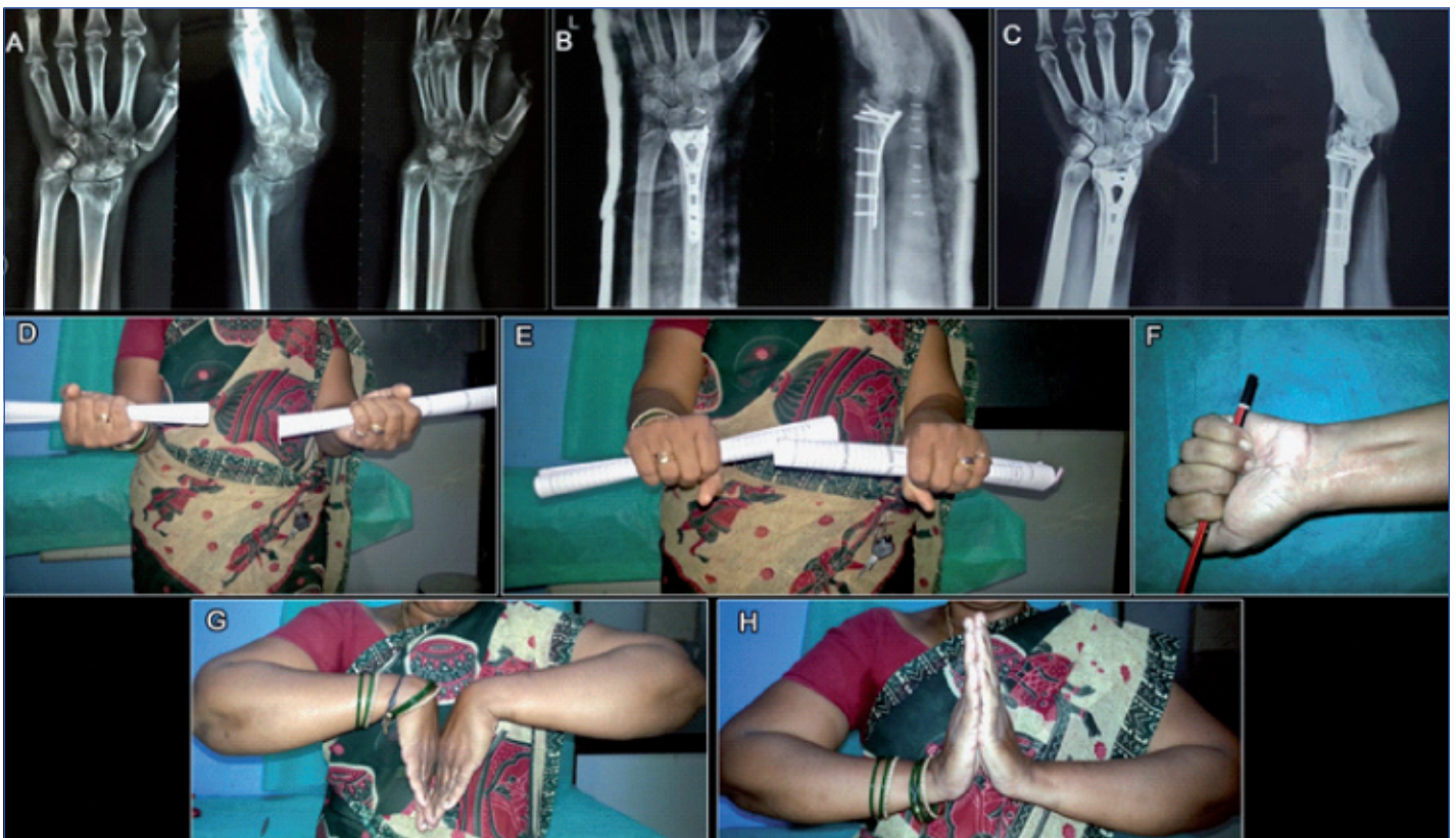
[Table/Fig-6]: Preoperative radiographs: (a) of 34-year-old lady with AO 23-B2 distal radius fracture. (b) Immediate postoperative radiographs showing good reduction of fragments with plate in-situ; (c) Radiographs at the end of 15 months showing no further collapse of fracture and restored radiological parameters; (d-h) showing excellent functional outcome.

An anatomical reduction of the articular surface with a stable fixation is the main goal in the treatment of intra-articular distal radius fractures. Improper reduction or residual intra-articular incongruity leads to secondary arthritis and poor functional outcome in the long term [5,6]. Various treatment modalities have been described for distal radius fracture fixation. Treatment options range from closed reduction and cast application to open reduction with plates and